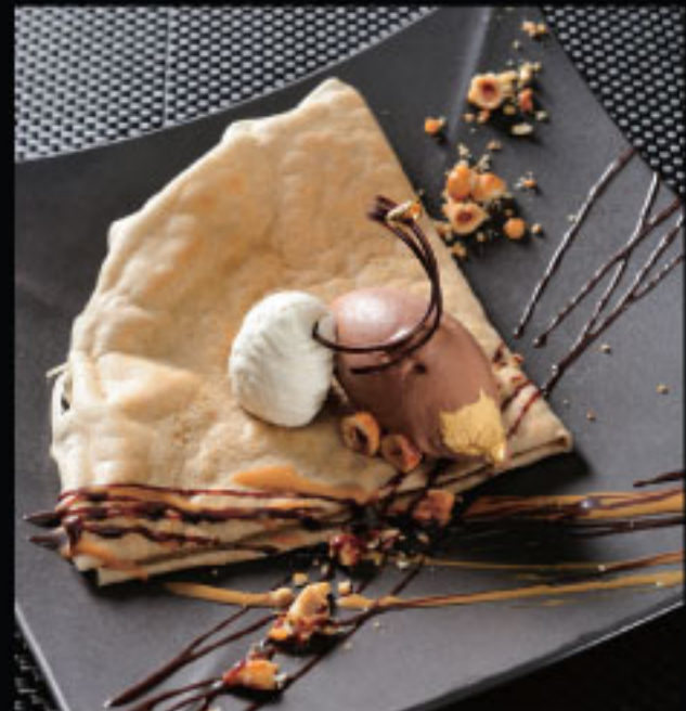
Chocolate <glace au chocolat, ganache, Praliné, feuilletine, crème chantilly et sauce café> ....$130 Chocolate ice-cream, ganache, praline crisp, whipped cream and coffee sauce