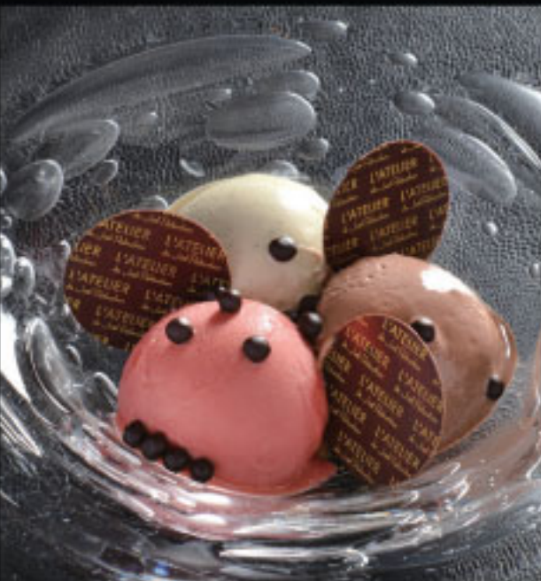
L'assortiment de glaces et sorbets Assorted homemade ice-cream and sorbet Single / Double / Triple $55 / $105 / $150