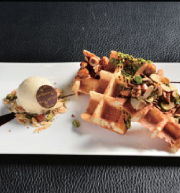
La gaufre aux noix et glace vanille.....$120 Toasted waffles with mixed nuts and vanilla ice-cream