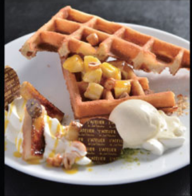
La gaufre banane caramel et glace vanille.....$140 Toasted waffles with caramelized banana and vanilla ice-cream