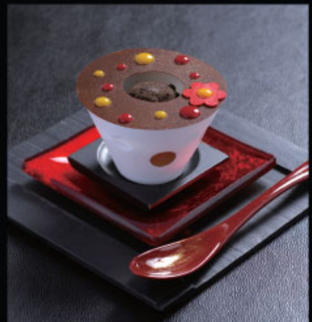
Le chocolate sensation.....$160 Creamy <<Guanaja>> chocolate, cacao ice-cream, chocolate biscuit