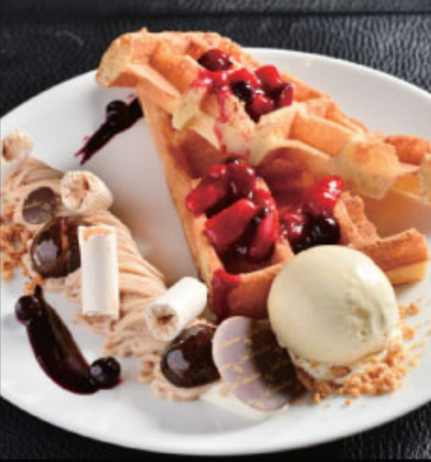
Le gaufre aux marron et glace vanille.....$140 Toasted waffles with chestnut and vanilla ice-cram